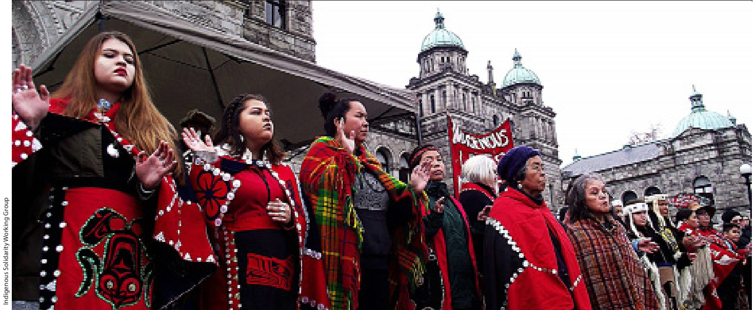
Indigenous Solidarity Working Group

Voices from the Salmon Frontlines at the Circle at the BC Legislature.