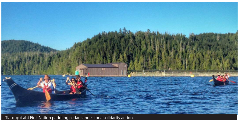
Tla-o-qui-aht First Nation paddling cedar canoes for a solidarity action.

Four days after the Action Guide was distributed, a solidarity action targeted BC Attorney General David Eby with a day long occupation of his constituency office in Vancouver. Two weeks later there were coordinated solidarity actions. In Victoria, solidarity group Fish Farms Out Now occupied the office of Minister of Agriculture Lana Popham. While in Port Alberni, Friends of Clayoquot Sound led an occupation of the office of the Minister of Indigenous Relations and Reconciliation, Scott Fraser, with support from members of the Tla-o-qui-aht and Ahousaht Nations. The BC Government Ministers indicated a meeting with the First Nations would happen within weeks.