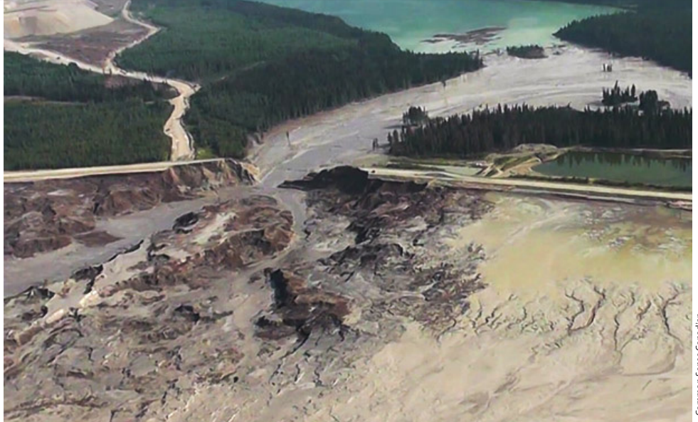
Imperial Metals Mount Polley Mine Disaster from August 4, 2014.

The legal action came after BC's newly formed NDP-Green government announced it would not file