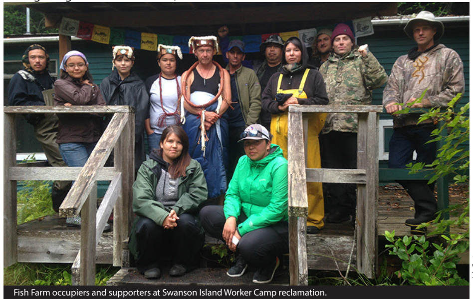
Fish Farm occupiers and supporters at Swanson Island Worker Camp reclamation.

Amidst the worst Fraser River sockeye run in history, First Nations are enforcing their sovereignty and jurisdiction by telling the governments of BC and Canada to revoke the illegal and invalid permits for these uninvited fish farms which do not have First Nations consent. Norwegian-owned fish farms operating in the Broughton Archipelago have pushed Sockeye and other native salmon populations to the brink of extinction and must be immediately removed from the marine environment. Government and industry need to work with First Nations to commit to just transition strategies for workers and communities. The timing is critical, and escalation beyond the province is imminent.