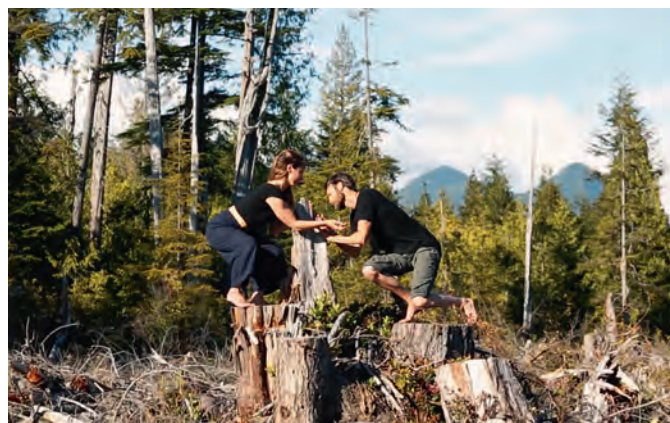
The Old Growth Collective are encouraging everyone to show solidarity by posting a video of dancing in the forest or a clearcut to the song "Move For The Trees" by Old Growth Collective, streaming on all platforms. Then share the video on social media and tag friends to challenge them to do the same and #MOVEFORTHETREES #WORTHMORESTANDING

especially Indigenous and remote communities as we move towards a more holistic economy where energy conservation is the goal and renewable energy is the source.