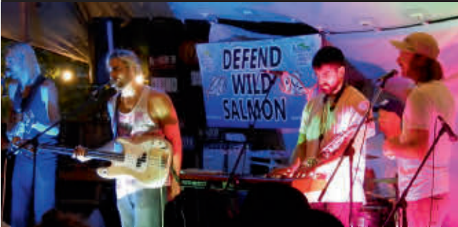
Clayoquot Salmon Festival kicked off with a doubleheader launch party featuring live music from Victoria based funkmasters, Downtown Mischief @downtownmischief at Lil Ronnie's Beachside BBQ @lilronniesbbq, tofino on the September long weekend. A big THANK YOU to everyone who contributed and participated in the 2022 Clayoquot Salmon Festival!